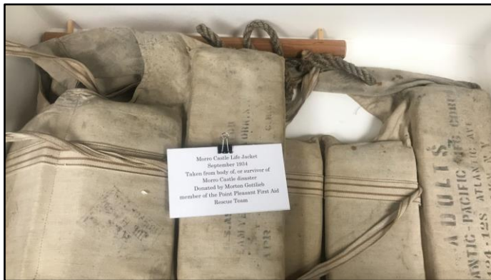
Lifejackets from the Morro Castle at the Point Pleasant Historical Museum.