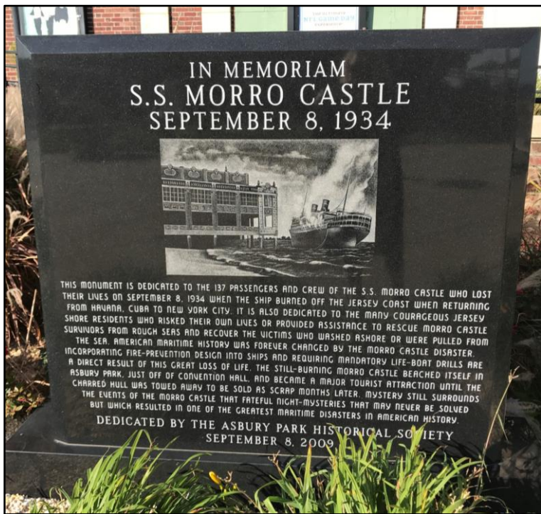
The Morro Castle Monument outside Convention Hall/Paramount Theatre in Asbury Park near the boardwalk.

In 2009, the Asbury Park Historical Society dedicated a monument on the south side of the iconic Convention Hall to remember both the victims from the disaster and to honor "the many courageous Jersey Shore residents who risked their own lives or provided assistance to rescue Morro Castle survivors from rough seas and recover the victims who washed ashore or who were pulled from the sea." The New Jersey Maritime Museum has an entire room dedicated to artifacts from the Morro Castle, and two lifejackets recovered from the ocean liner are a part of the Point Pleasant Historical Museum's collection.