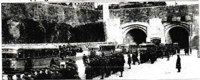
Opening ceremonies for the Lincoln Tunnel in 1937.

1935 —Amelia Earhart made the first public parachute jump at the Switlik Parachute Company in Jackson Township.